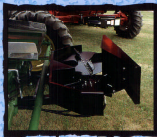
Single and Tilting Double Disc CYCLONES are available for all major combine models.

eliminating uneven soil drying and staggered wet strips. CYCLONE also reduces interference with chemicals caused by wet and heavy windrows.